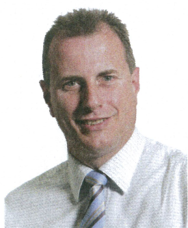
PAUL HENDERSON NT Chief Minister

Darwin Festival brings the Top End to life!